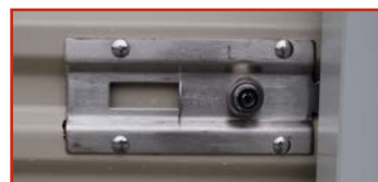
Photo of Noke system - Janus International

The Spaceguard latch is standard, factory installed.