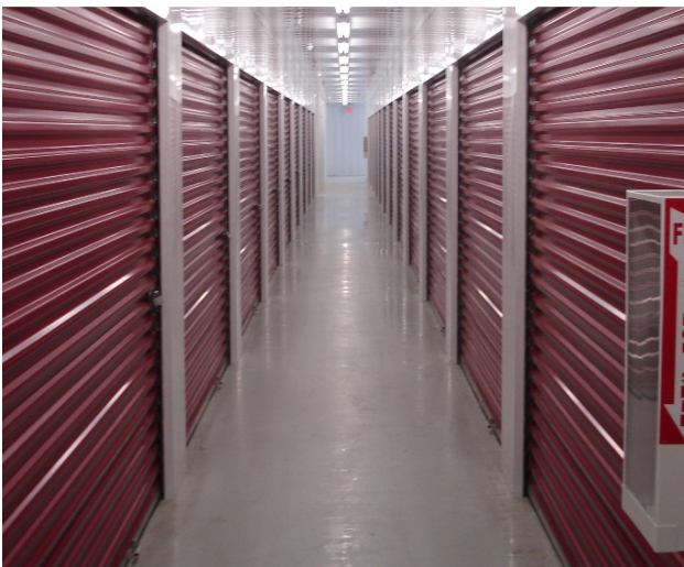
Building shells by others featuring Trac-Rite doors, hallways, and partitions.

Trac-Rite is your experienced partner for planning, manufacturing, and installing doors, hallways, and storage partitions.